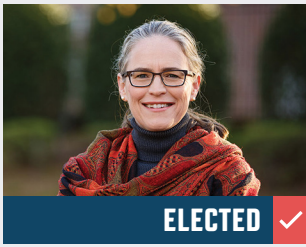
CAROLYN BOURDEAUX U.S Congress GA-07